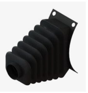
Custom & Bespoke Components