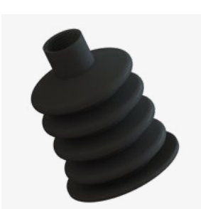
Gaiters & Bellows